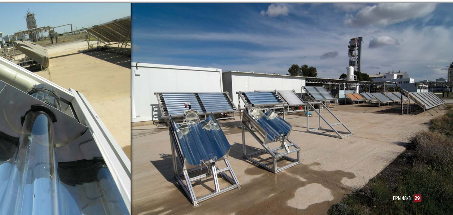
▼ FIG. 5: View of several solar CPC reactors with different design concepts installed at Plataforma Solar de Almería, Spain.