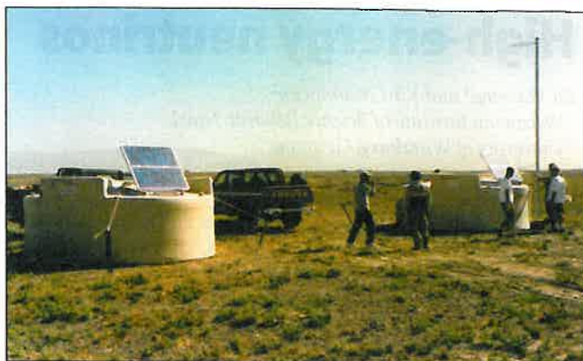
Fig. 2: Two of the tanks in the Pierre Auger Observatory are shown. They each hold 12 tonnes of clean water and are viewed by 3 \times 8'' diameter photomultipliers. The electronics for recording and data transmission are powered by solar cells. These tanks are placed close together so that cross-tank measurements of densities and arrival times can be made but the nearest neighbour for all other tanks is 1.5 km away. In this way 3000 km 2 can be covered with only 1600 detectors.

To achieve an exposure greater than that targeted by the Auger Observatory may require putting a detector into space. The idea, proposed by Linsley, who was also the first to claim detection of a 10^{20} eV event, is to observe the fluorescence light using a detector mounted in a satellite. As a first stage an instrument with 2 \times 10^5 photomultipliers has been designed for the International Space Station and is the subject of an ESA phase-A study. Called EUSO, for Extreme Universe Space Observatory, it will be come into operation in 2007 and should detect 3000 events above 10^{20} eV in